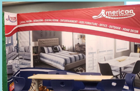
Example of Customized Mobile Display Branding