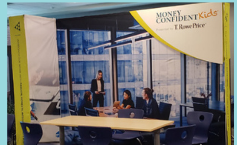
Example of Pre-Designed Mobile Display Branding