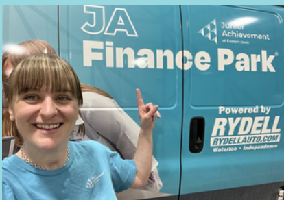
Example of Van Branding